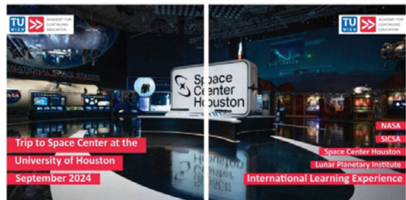
Image 02: EVAs. Cooperative International Workshop for Advances Space Architecture, September 2024.

surface, which enables a much less massive and more lightweight construction as the effect of gravity on the moon is far less than on earth, namely by a factor of 6. The concept enables a minimized transport volume to be transformed into a utilizable volume that is many times greater, thanks to an automated configuration process conducted at the final deployment location. A core element of the habitat is the solid framework structure, together with the engine segments located externally on each side and comprising the fuel tanks needed for operation of the braking thrusters for the descent onto the moon’s surface and, in the upper part of the segments, thrusters for correcting the trim during landing. The second key aspect of the concept is the possibility to avoid the need to equip the large utilizable space of the module retrospectively by bringing in the required interior elements from outside, but instead to already include 90% of these interior elements in the initial configuration and then simply take them into operation through straightforward, mostly manual work procedures.