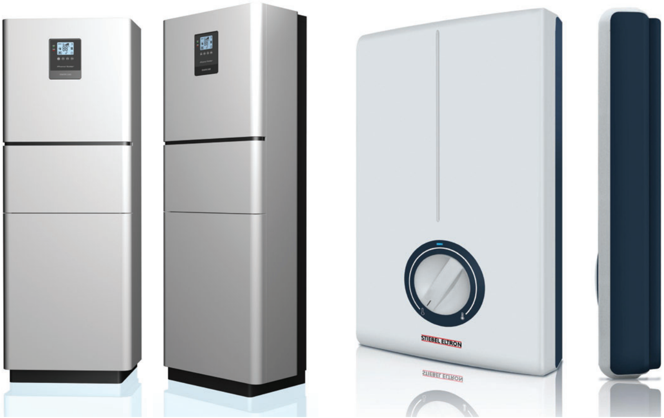
Top, left: Solar energy retainer unit for Phono Solar China. Top, right: Durchlauferhitzer (flow-type calorifier) XG Stiebel Eltron Asia Ltd Thailand